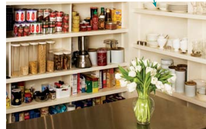
CLOCKWISE FROM RIGHT: Veltman added a range in the dining area. "When I cook I want to be around people, not secluded," says Veltman. Storage is confined to the kitchen prep area to keep the dining area from becoming too cluttered.