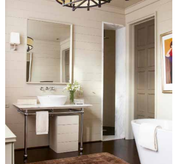
FAR LEFT: When the master bedroom's wall space was allotted to a fireplace (not shown) and a window seat under a gracious Tudor arch, Veltman added a floating wall at the room's entrance to anchor the bed. LEFT: A 19-inchwide doorway beside the sink in the master bath provides a portal to a circular shower built into the nonfunctioning part of the home's main chimney.